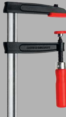
Malleable cast iron screw clamp TPN with tried-and-true wooden handle