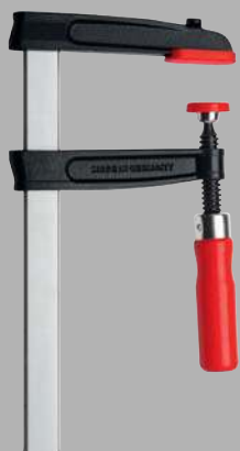
Malleable cast iron screw clamp TGRC with tried-and-true wooden handle