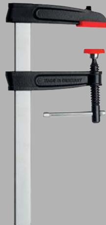
Malleable cast iron screw clamp TGRC with tommy bar