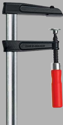
Heavy duty malleable cast iron screw clamp TKPN with tried-and-true wooden handle