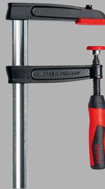
Malleable cast iron screw clamp TPN with 2-component plastic handle