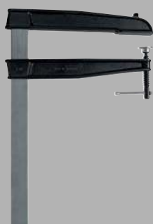
Deep throat screw clamp TGNT with tommy bar