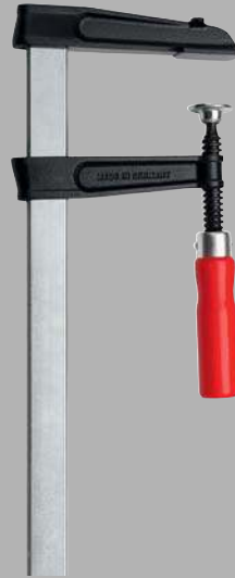
Heavy duty malleable cast iron screw clamp TGKR with tried-and-true wooden handle