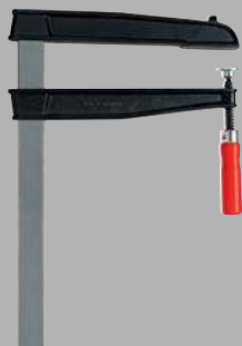
Deep throat clamp TGNT with tried-and-true wooden handle